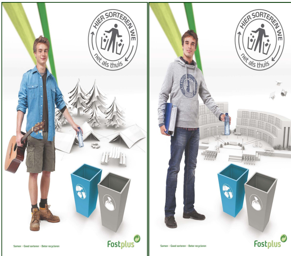
Fost Plus posters encouraging citizens to recycle in out-of-home situations