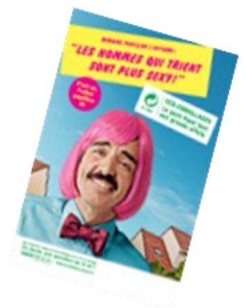
An example of Eco-Emballages' new awareness campaign in France