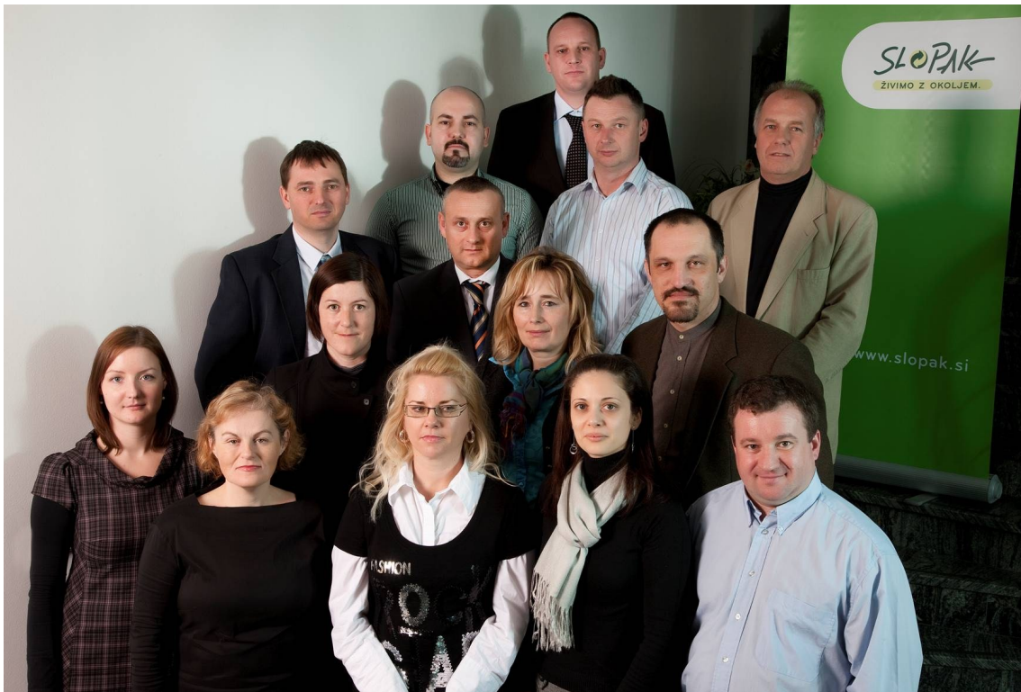
The Slopak Team