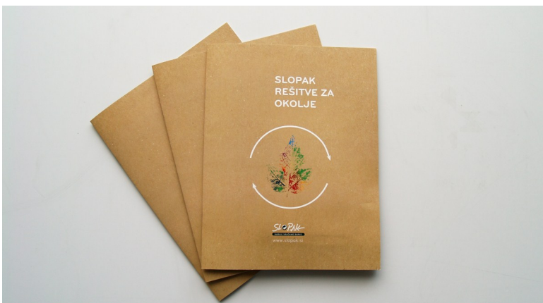
The Slopak Brochure